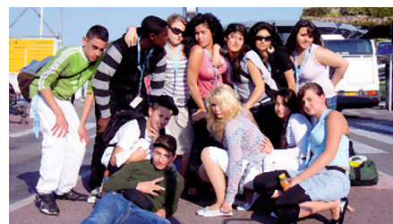
The global steps in Marseille

The intercultural competence in society will be encouraged.