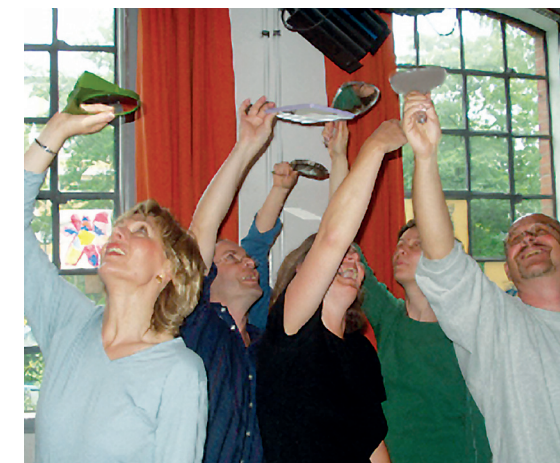
Performance in front of a mirror from the group members

The presentation in front of the other group members is an important and useful issue of these projects. It is also the end and the highlight for all members.