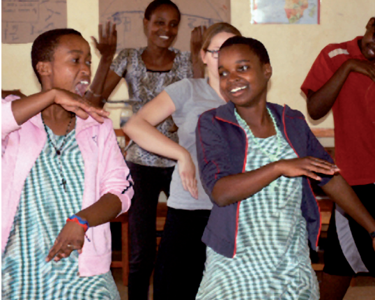
First One-World European-African Academy

There is no perfectionism necessary, but try to experiment. The performance gets inspired from the member ideas. We especially work for the artistic expression.